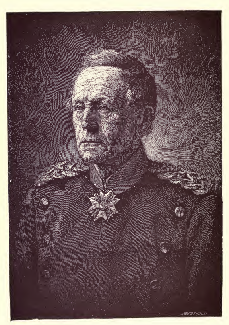
GENERAL VON MOLTKE